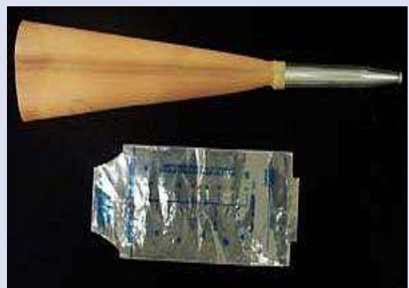
Figure 4. Conical rubber plastic, lubricant pomade and collection tube (Anonymous).

By gently massaging the penis from the outside of the preputium, the collector inserts the penis into the conical rubber plastic after the erection is formed. After pelvic thrusting movements, the rubber is held in the palm and the penis is turned back by applying pressure to the