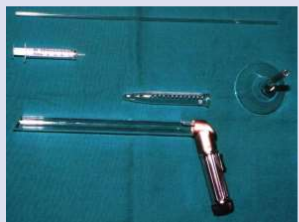
Figure 8. Intravaginal insemination set (Baran, 2015).

In bitches, it is somewhat difficult to perform intrauterine insemination by trans-passing the cervix due to anatomical reasons such as the long vagina, narrowing in the paracervical region, and ventral angle of the cervix. Intravaginal insemination has been suggested by many researchers and studies have been carried out on this subject because it is easy to apply with both fresh and frozen semen (Ucar, 2000). In most studies, pregnancy rates in intravaginal insemination with fresh semen are quite high. By this method (especially with fresh semen), 80% success is achieved in insemination (Baran, 2015) (Figure 8).