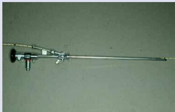
Figure 14. Endoscopy device used in intrauterine insemination (Anonymous).