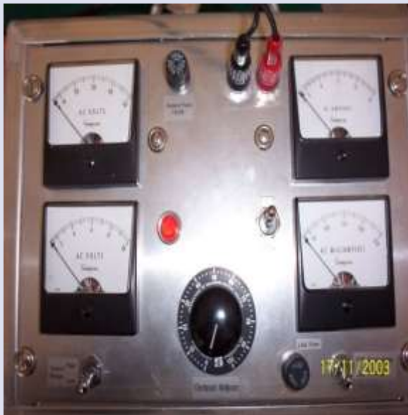
Figure 6. Electro-ejaculatory device (Baran, 2015).