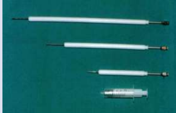
Figure 10. Three different sizes of norwegian catheters (Baran, 2015).