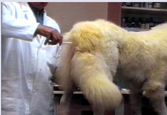
Figure 11. Advancement of rigid plastic tube from the vagina to the front of the cervix (Anonymous).