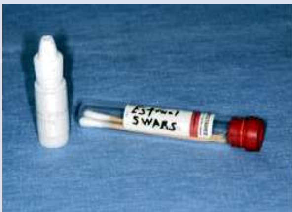
Figure 1. Cotton swabs used in taking vaginal swabs (Anonymous).

In recent studies conducted, marked increases in the number of spermatozoa collected have been noted with the administration of 0.1 mg/kg PGF2 \alpha to the male dog 15 minutes before the semen is collected. Male dogs respond better to vaginal swabs than synthetic chemicals. The experience of the person collecting the semen can also affect semen collection during this application (Figure 1).