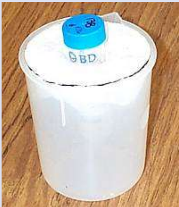
Figure 7. Cooling semen in a water container (Anonymous).

Among them, although zwitterionic (bipolar) solutions such as Tes (N-Tris [hydroxymethyl] methyl-2 amino-methane sulfonic acid), Hepes (N2 [hydroxymethyl] piperazine-N-2-ethane sulfonic acid) and Pipes (piperazine-N, N-bis-2-ethane sulfonic acid) with a better buffering capacity compared to Tris are used, more ready-made commercial preparations (Laiciphos, Biociphos, Biladyl, Triladyl, Andromed, etc.) have been preferred for freezing dog semen in recent years (Silva and Versteegen, 1995) (Figure 7).