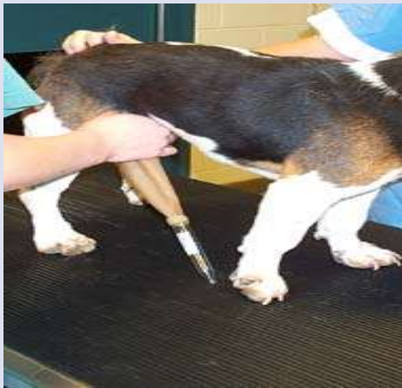
Figure 5. Semen collection with conical rubber plastic and hand massage (Anonymous).

posterior part of the bulbus glandis. This method has a disadvantage since the three fractions of the semen cannot be collected separately from each other (Baran, 2015).