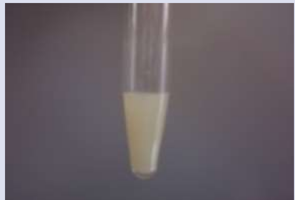
Figure 3. Sperm-rich 2nd fraction (Baran, 2015)