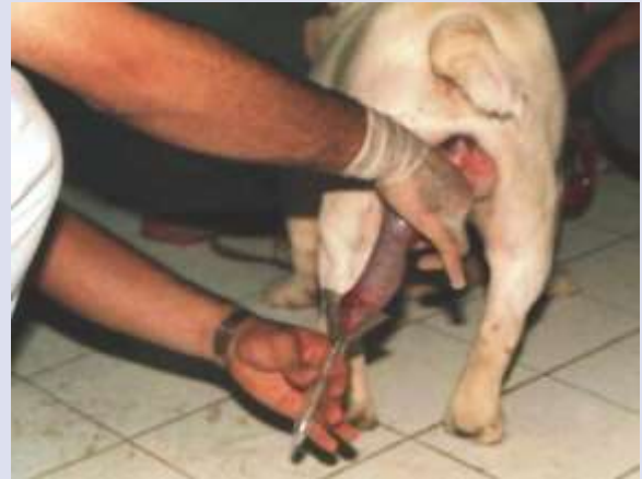
Figure 2. Collection of semen from the dog by hand massage (Baran, 2015).

semen stands on the right side of the male dog and holds the conical rubber plastic in his right hand (Figure 5).