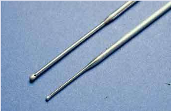
Figure 9. Tips of scandinavian steel catheters (Anonymous).

It requires technical expertise. This has been caused by the rather narrow-short cervix and posture-angle in bitches, as suggested (Baran, 2015) (Figure 13).