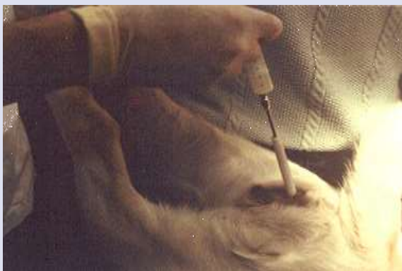
Figure 13. Passing the steel catheter through the plastic tube and depositing the semen (Anonymous).