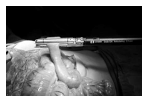
Figure 1. Transection of jejunum

The choice of the RYA technique (stapler or hand-sewn) was determined by preference of the senior surgeon. In all patients (CC and BA) laparotomy with intraoperative cholangiography composed the first phase of the operations. After excision of the CC or fibrotic tissues including bile duct remnants in BA, a retro-colic Roux-en-Y loop of jejunum was prepared with the length appropriate with the size of the patient. Then an end-to-side porto-enterostomy (for BA) or hepatico-jejunostomy (for CC) was performed with the same technique in all cases.