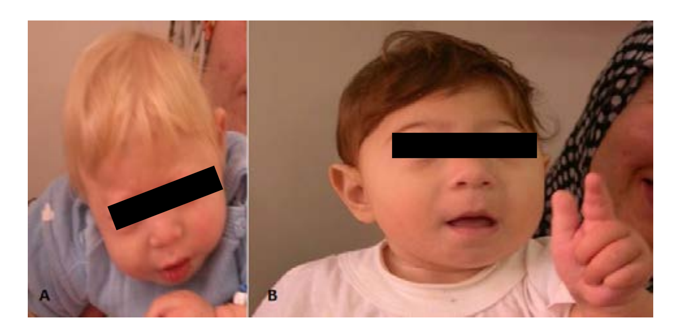
Figure 1. Typical facial appearance of fraternal twins. Male(A) and female (B).