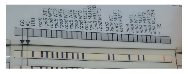
Figure 1: INH resistance detected in the inhA locus (loss of InhA wild type 1)

negative. This patient had no clinical and radiological findings and was considered as contamination.