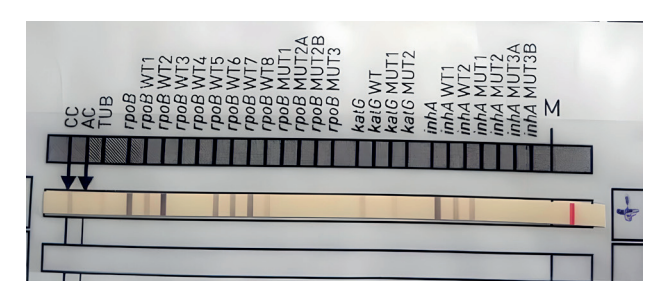
Figure 3: Rifampin resistance by mutations in the rpoB locus (loss of rpoB wild type2 and 3) and INH resistance detected in the katG locus (loss of katG wild type 1) and detection of kat G MUT 1)